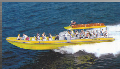
54' RIB Tour Boat

Five decades of designing world champion offshore race boats, high speed assault boats for the U.S. military and commercial RIBs, has culminated with the introduction of the new Scarib Stability System with aftermarket compatibility for aluminum and fiberglass boats.