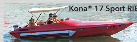
Kona® 17 Sport RIB