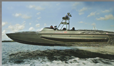
43' U.S. Military Assault