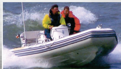
Zodiac Proluxe 561