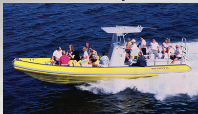
34' RIB Tour Boat