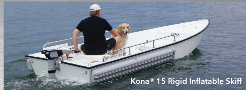
Kona® 15 Rigid Inflatable Skiff